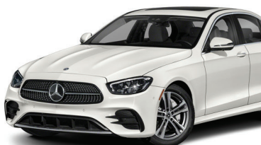
2021 Mercedes-Benz E 450